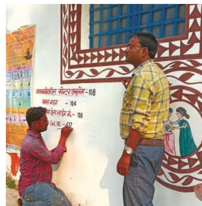
The HWC underwent significant improvement after WHP team pointed out the missing branding in the HWC to the authorities

The District Manager shared these findings and gaps with the Block Project Manager, Medical Officer in Charge and the District health officials. By November end, funds were released after which repairing, beautification work and branding was undertaken and the HWC got a new look.