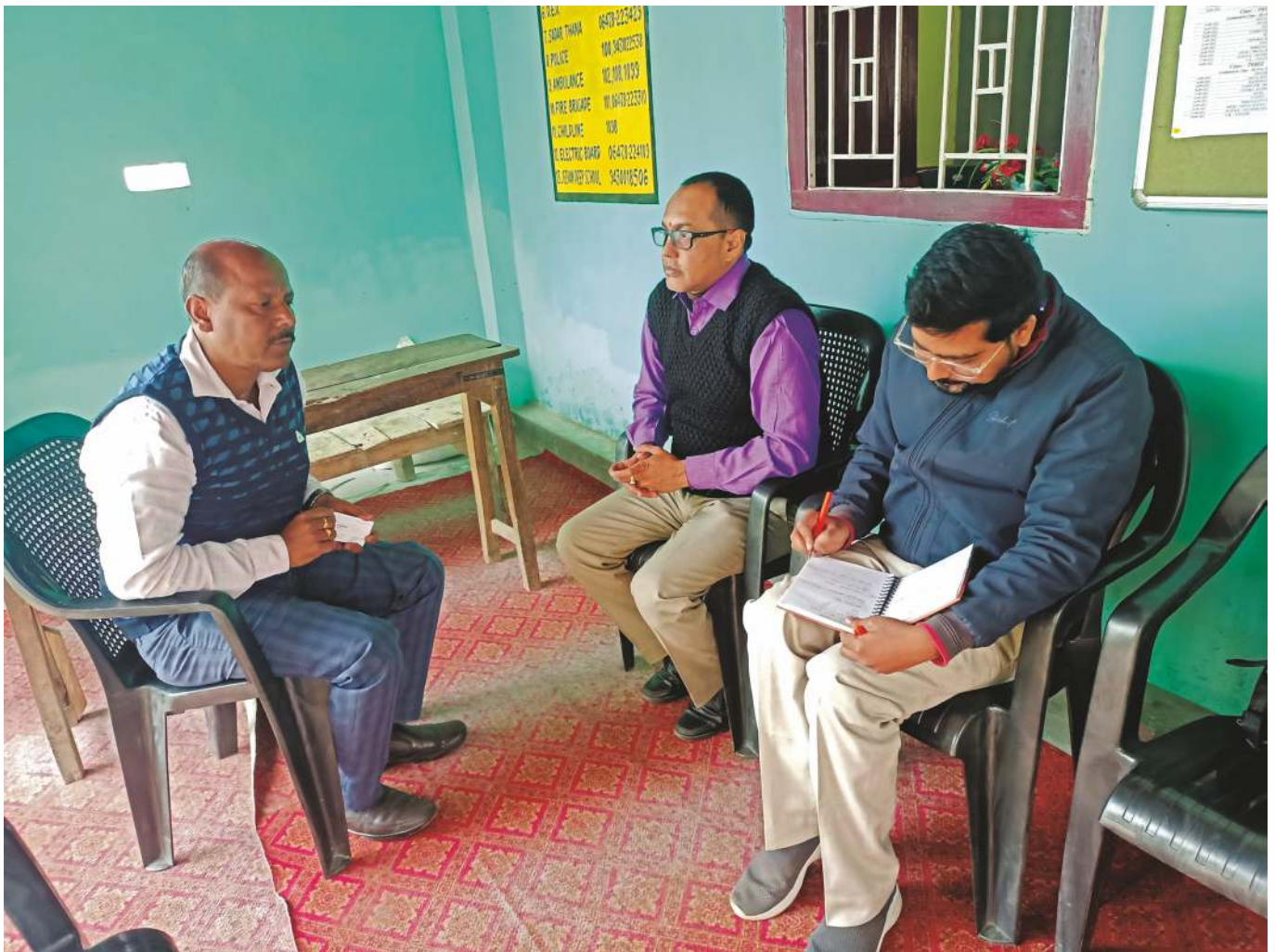
Team members talking to a school headmaster about WHP's initiative to give children quality learning opportunity by connecting them online with experienced teachers