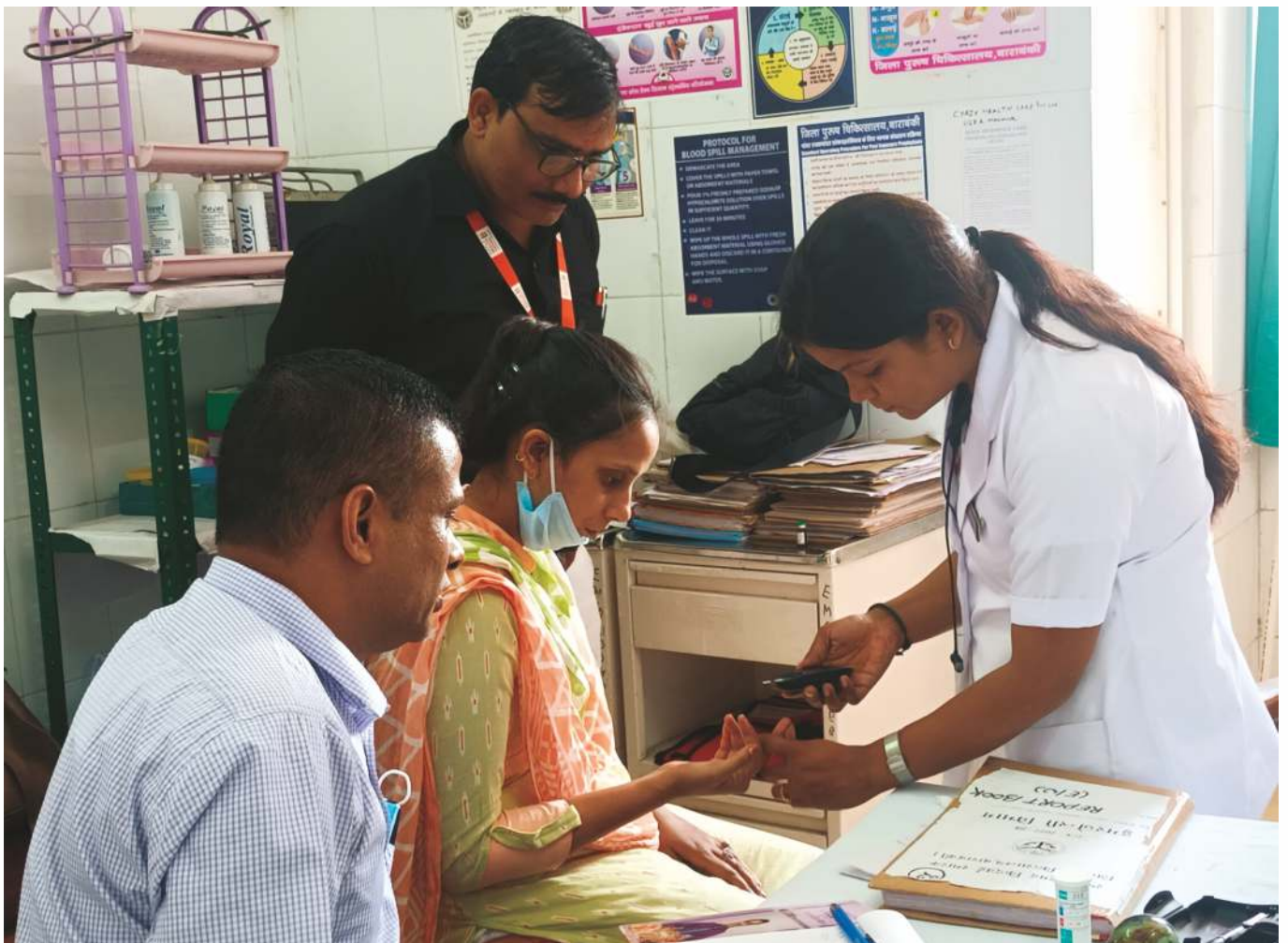
WHP Team participating during demonstration of vitals assessment (SPo2) at Barabanki District Hospital in Uttar Pradesh