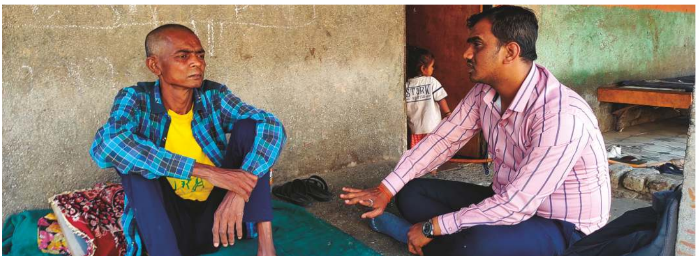
WHP Care Coordinator providing in-person mental health counselling to a beneficiary at his home