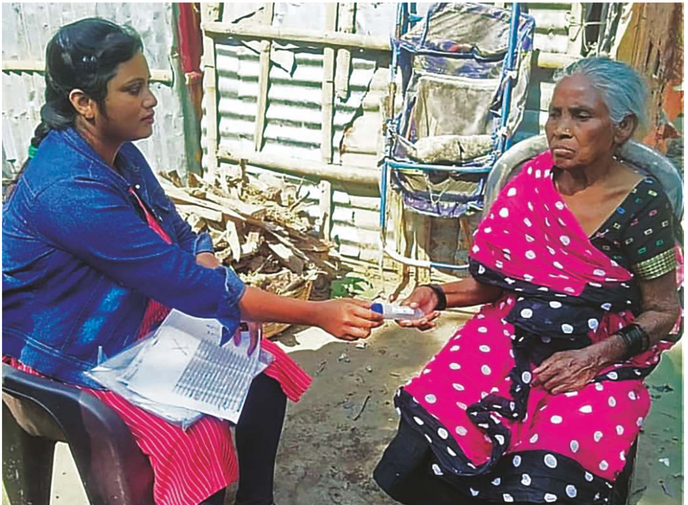
A field officer is handing over medicine to a beneficiary during a follow-up visit done for counselling and treatment adherence