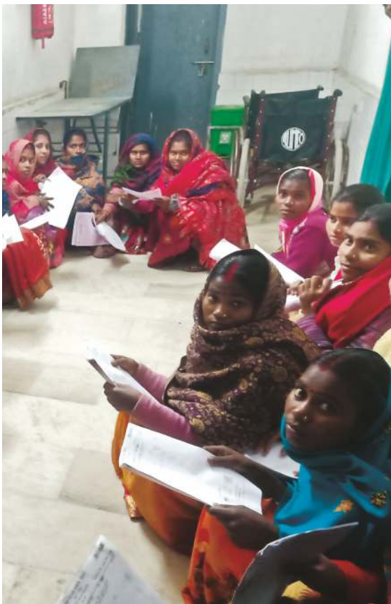
Women clients waiting for lab investigation before undergoing sterilization