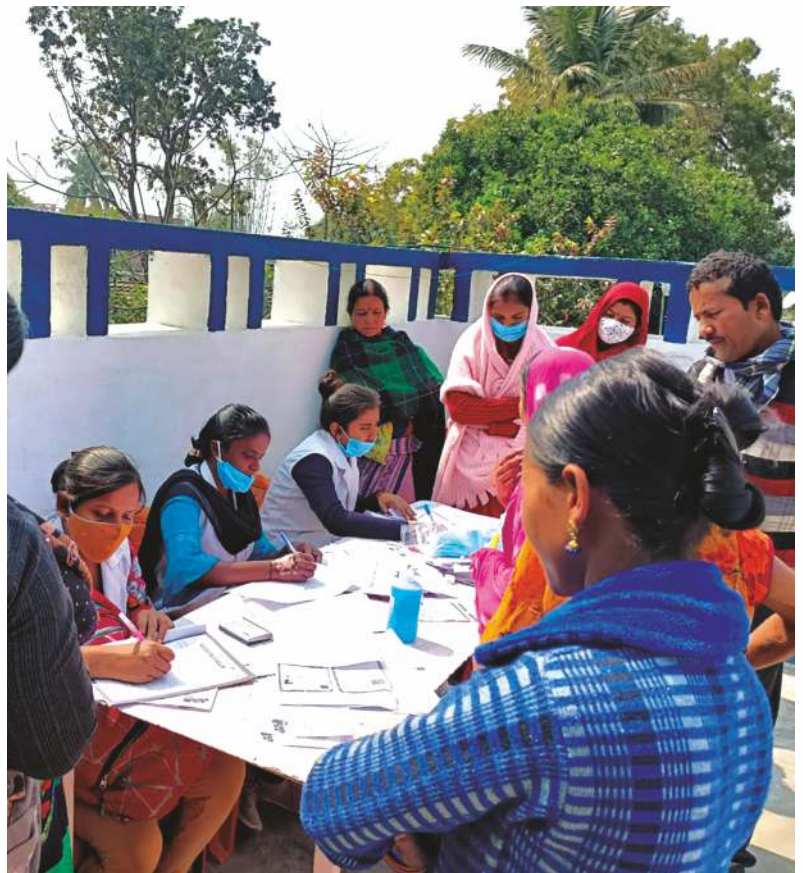
Clients waiting eagerly for registration at the Primary Health Centre for sterilization