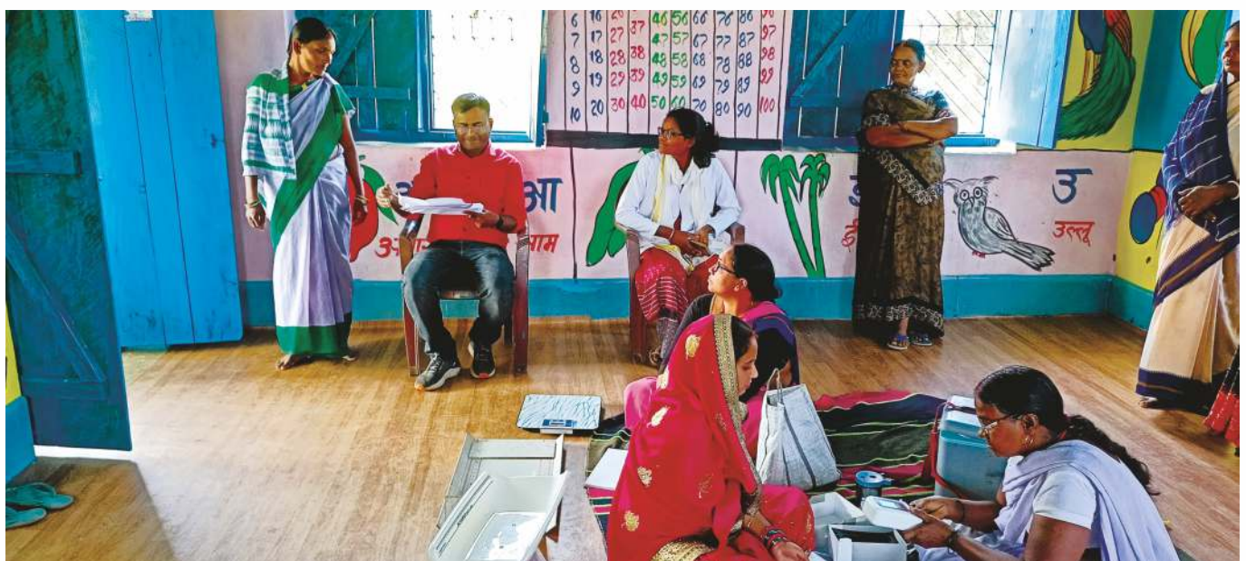
Community assessment is being done by the District Manager at village Matlong in Manika Block, Latehar, Jharkhand