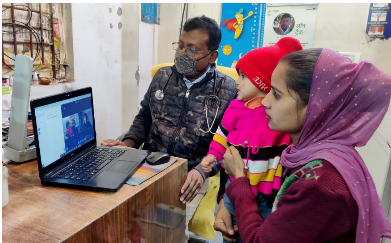
A mother seeks consultation for her baby from the city doctor with the help of a service provider connected to WHP's Entrepreneur Network